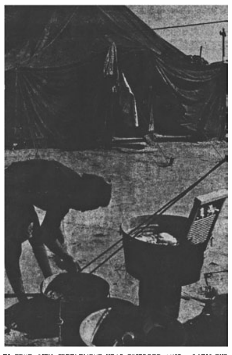
IN TENT CITY SETTLEMENT NEAR TRIBBETT, MISS., DOING THE FAMILY WASH IS A PROBLEM FOR THE WOMEN WHO LIVE THERE.