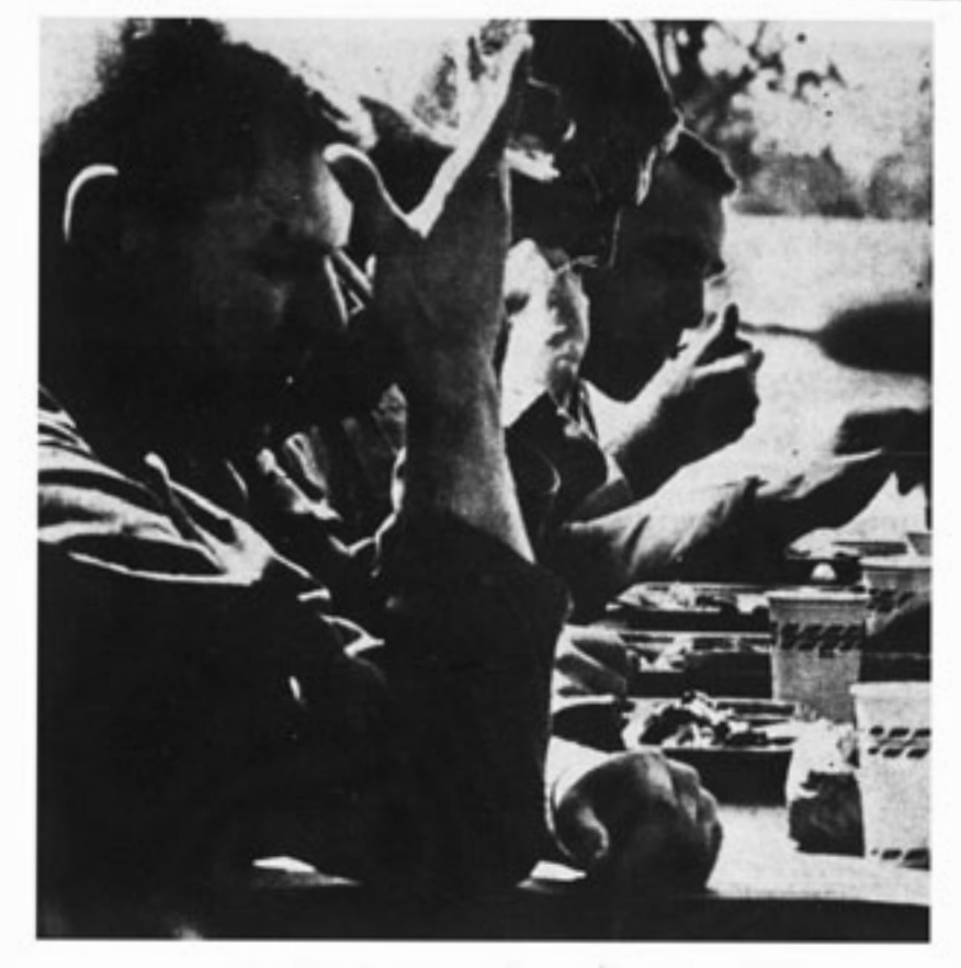
STUDENT PILOTS EAT LUNCH AT 'TAC-1'