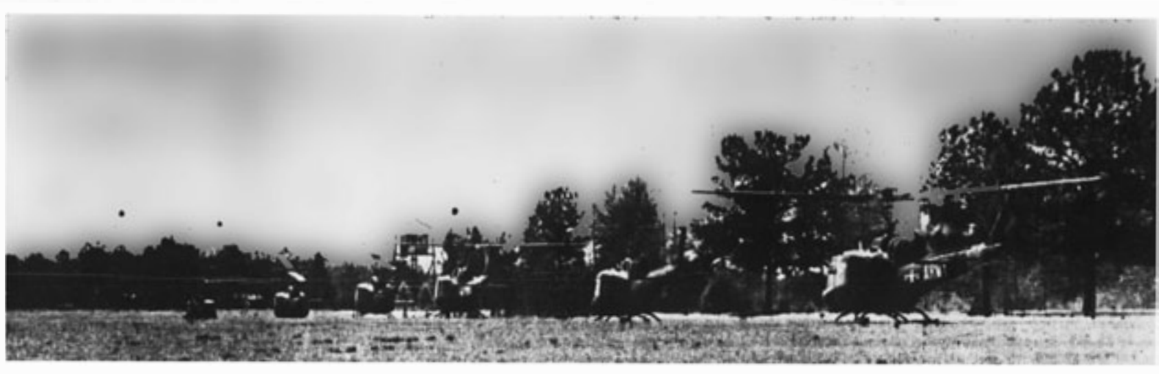
SQUADRON OF UH-1 HELICOPTERS PREPARES TO TAKE OFF ON 'COMBAT' ASSIGNMENT, ANOTHER SQUADRON IS ALREADY AIR-BORNE