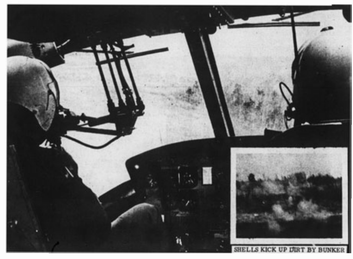
AT THE FIRING RANGE INSTRUCTORS START PASS ON 'ENEMY BUNKER'