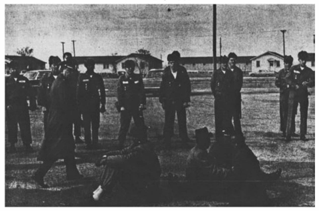
LAST JANUARY SOME OF THE HOMELESS PEOPLE TRIED TO STAY AT GREENVILLE AIR FORCE BASE