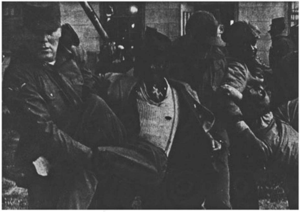
POLICE DRAGGED THEM FROM THE BUILDING, AND THEY HAD TO MOVE INTO TENTS