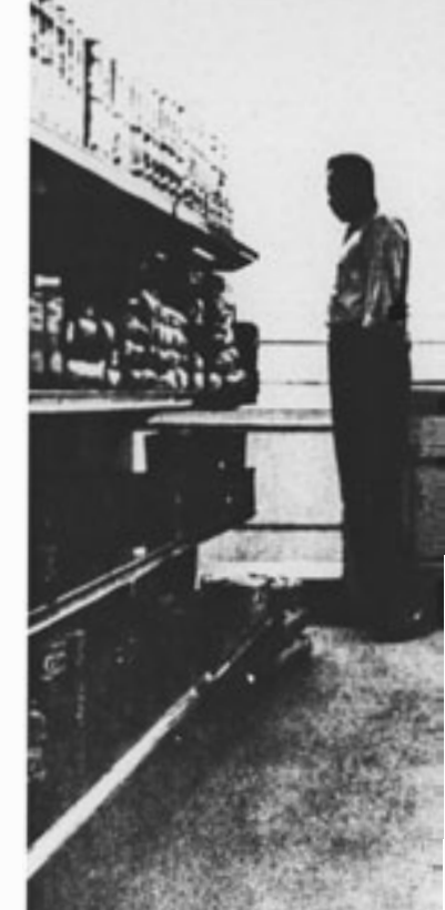
READY FOR BUSINESS

Black said some people don't understand the purpose and value of a credit why the credit union sometimes has services."