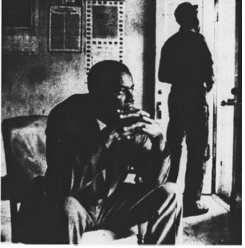
GREENALA CREDIT UNION HELPED START THIS STORE