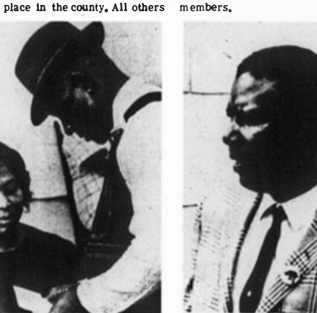
A VOTE IN THE SHERIFF'S RACE

The courthouse is the only public polling place in the county, All others