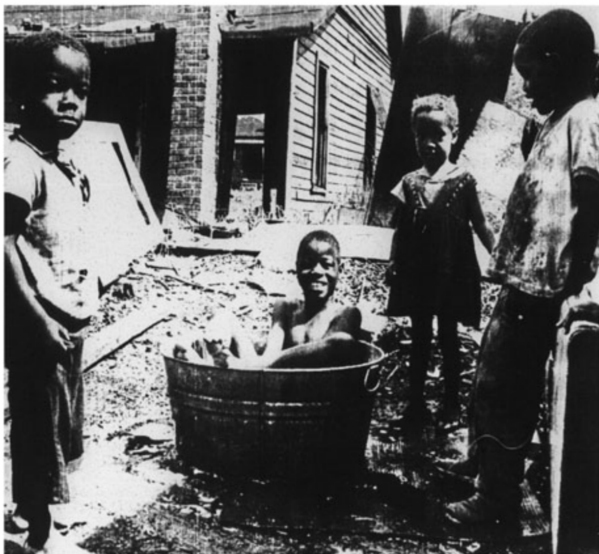
THE CHILDREN SEE POVERTY ALL AROUND THEM ...