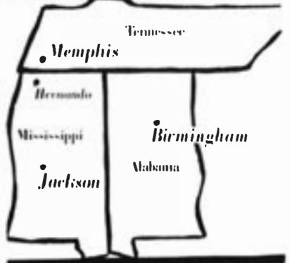
HERNANDO, SITE OF SHOOTING