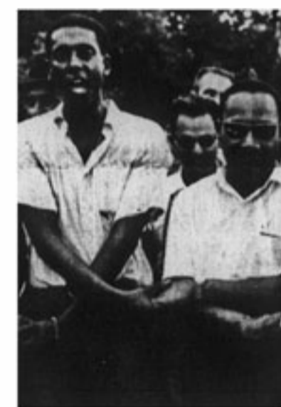
CARMICHAEL AND DR. KING

Dr. King said the march to Jackson would probably have a "greater impact" than the 50-mile walk from Selma to Montgomery last year. "We're going all out to make this the most momentous march we've had in this section of the country," he said.