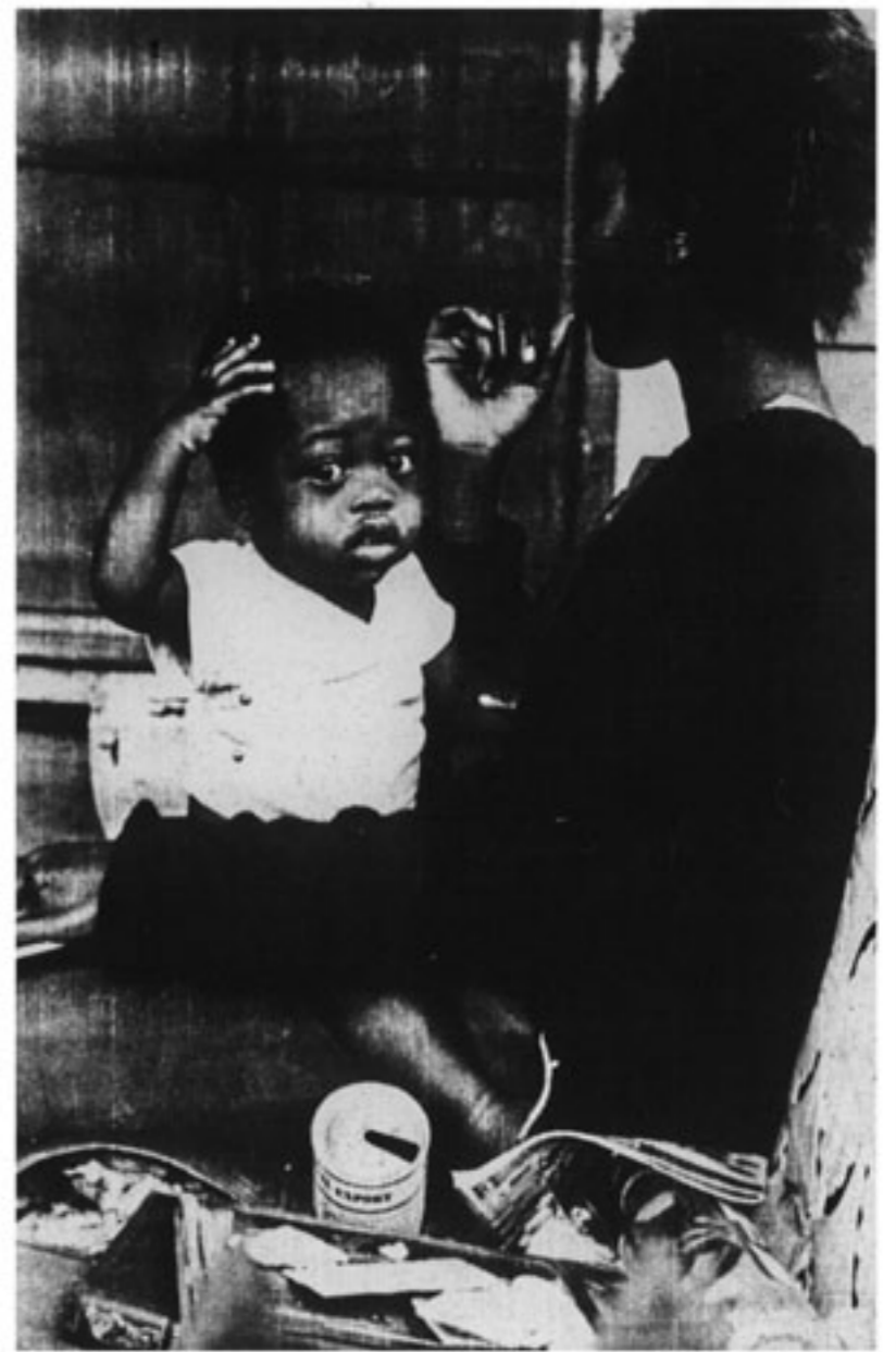
... AND RAISE THEIR CHILDREN THERE