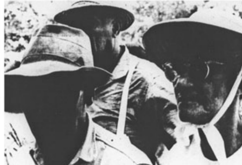
TENSION HAS BEEN HIGH ALL SUMMER