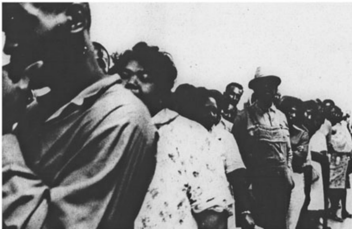
HUNDREDS OF NEGROES REGISTERED TO VOTE DURING THE MEREDITH MARCH

Even now, people have a better idea of how to work on things. They have sat in federal court and seen that the law can be their friend. They have found out how to get help from civil rights lawyers. And they have learned about using their dollar and their vote to get what they want.