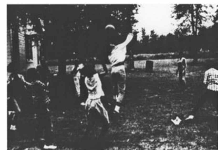
BOYCOTTING STUDENTS PLAY VOLLEYBALL