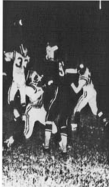
CARVER TRIES A PASS

Wall: "Because that's the only place they have Toronto."