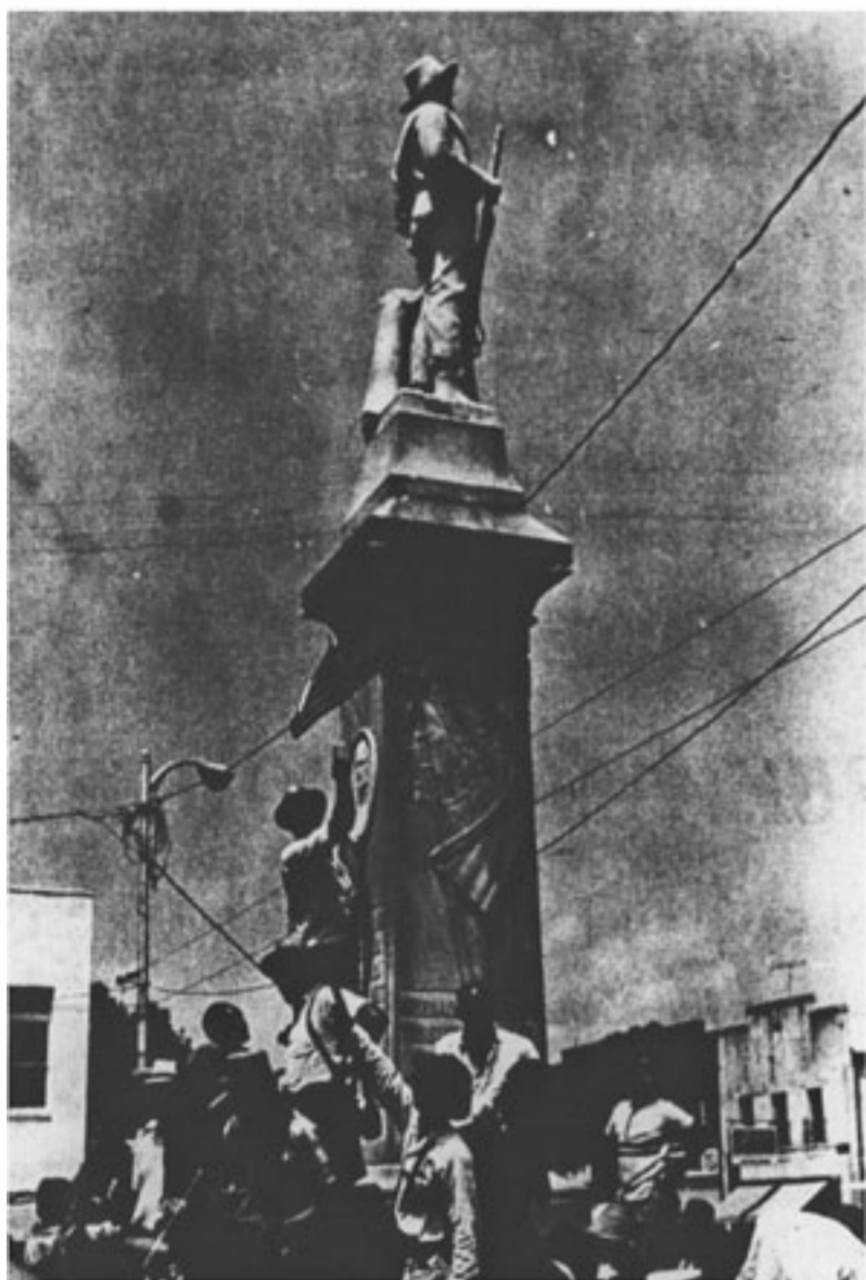
IN JUNE, MEREDITH MARCHERS PLACED AN AMERICAN FLAG ON THE CONFEDERATE MONUMENT IN GRENADA