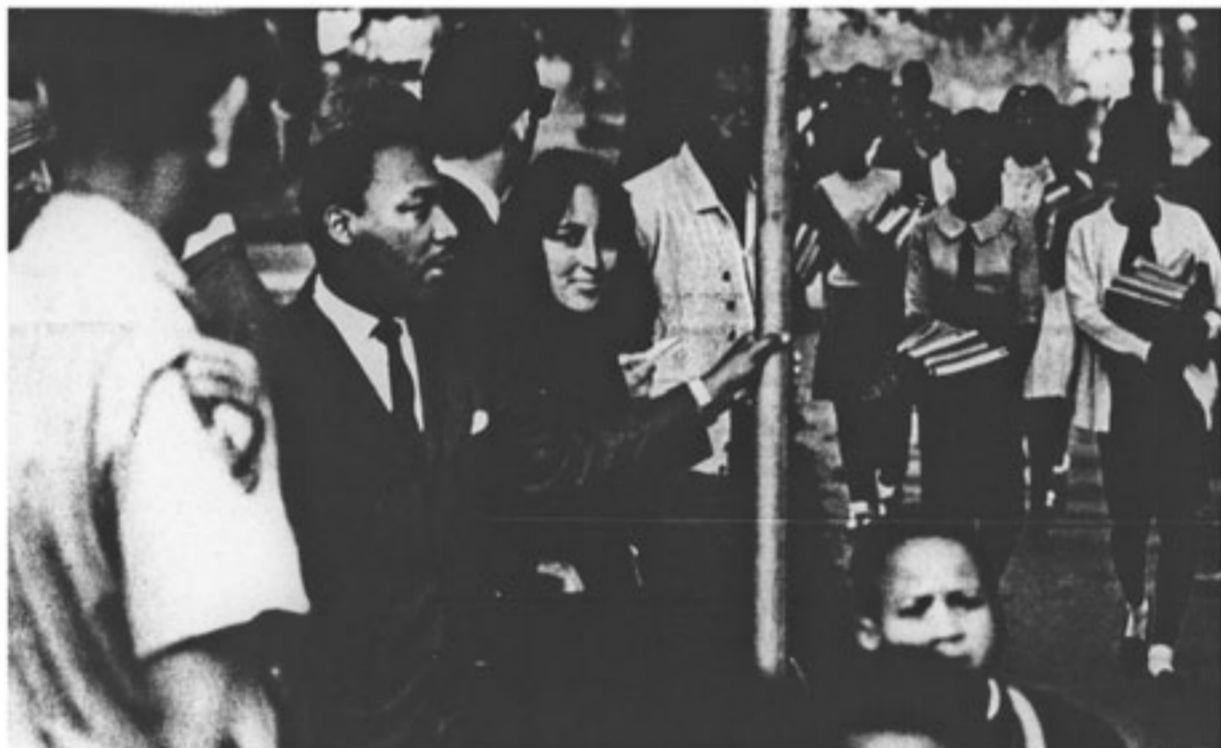
THIS WEEK, DR. MARTIN LUTHER KING RETURNED TO AID GRENADA'S MOVEMENT