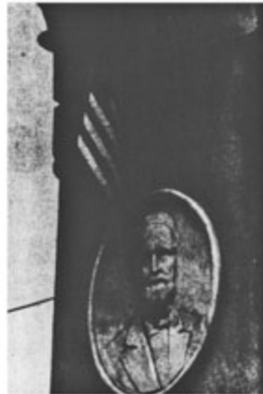
city and county of Grenada.

"The savage and senseless and, I might say, futile series of events of Monday and Tuesday are not only the shame of the active participants in those events; they are also the shame of all the people of Grenada County and also the shame of all the people who are possessed of public leadership. . . in the