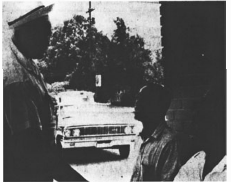
ON THE CAMPAIGN TRAIL