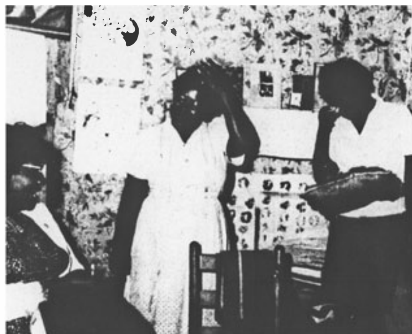
PARENTS VISIT REGULARLY

But the program hasn't had any trouble winning community support. When some children "graduated" into the first grade at the end of the summer,