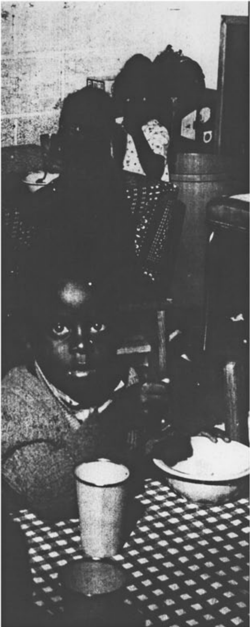
CORN FLAKES FOR BREAKFAST