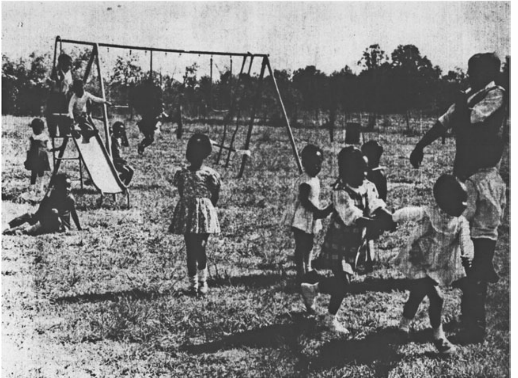
CHILDREN PLAY OUTSIDE HEAD START CENTER IN GEIGER