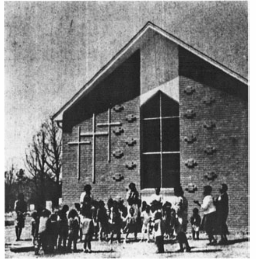
HEAD START CLASS PLAYS OUTSIDE NEW CHURCH