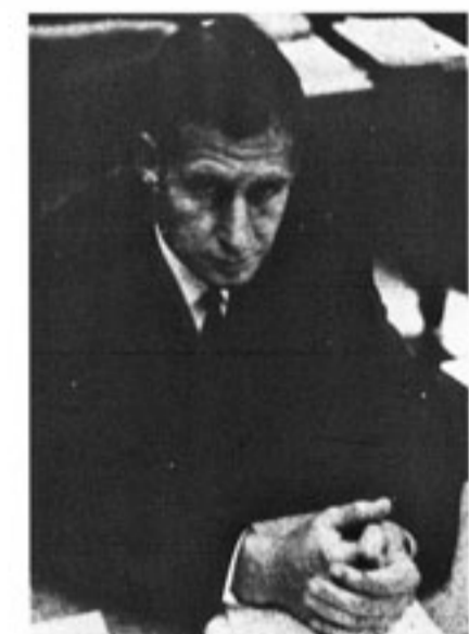
FRANK M. JOHNSON JR.