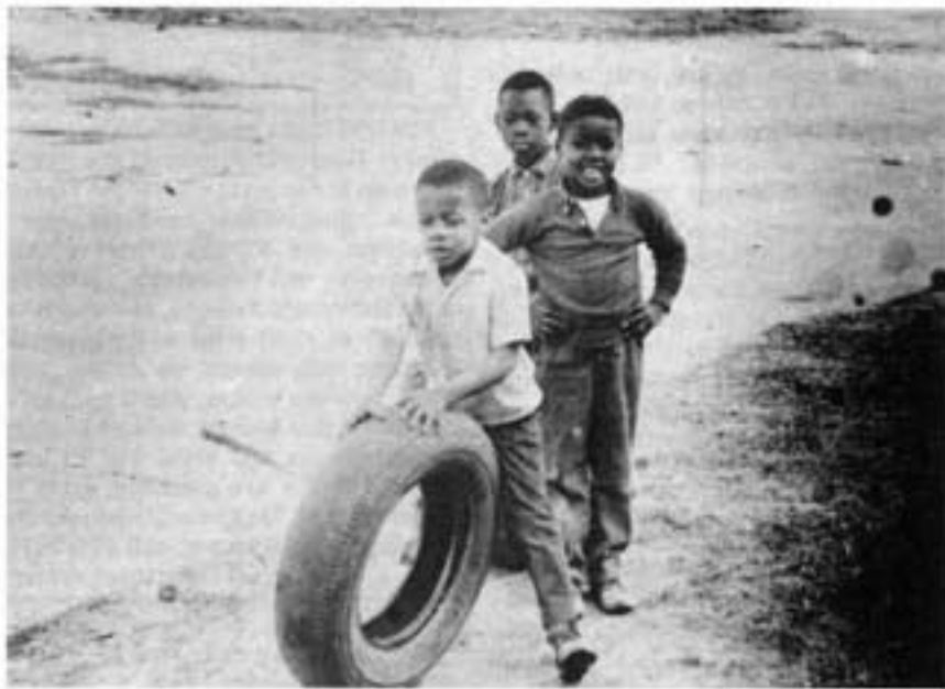
CHILDREN AT PLAY IN MITCHELL VILLAGE

Meanwhile, the NAACP is paying the rent for all 41 out-of-work farmers, and trying to find them enough food and clothes.