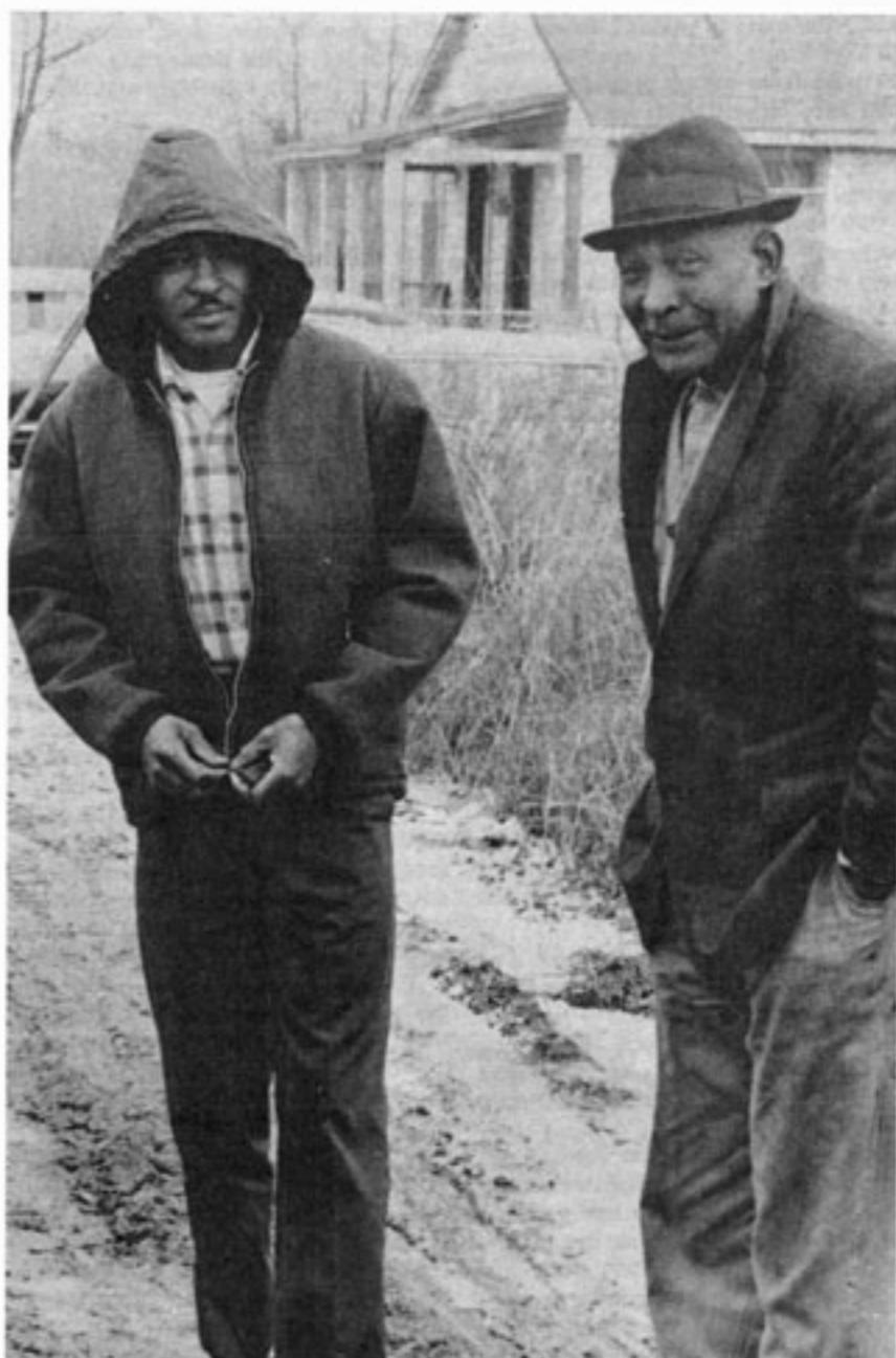
RESIDENTS STAND IN MUDDY ROAD