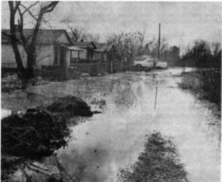
STREET IN EAST SELMA