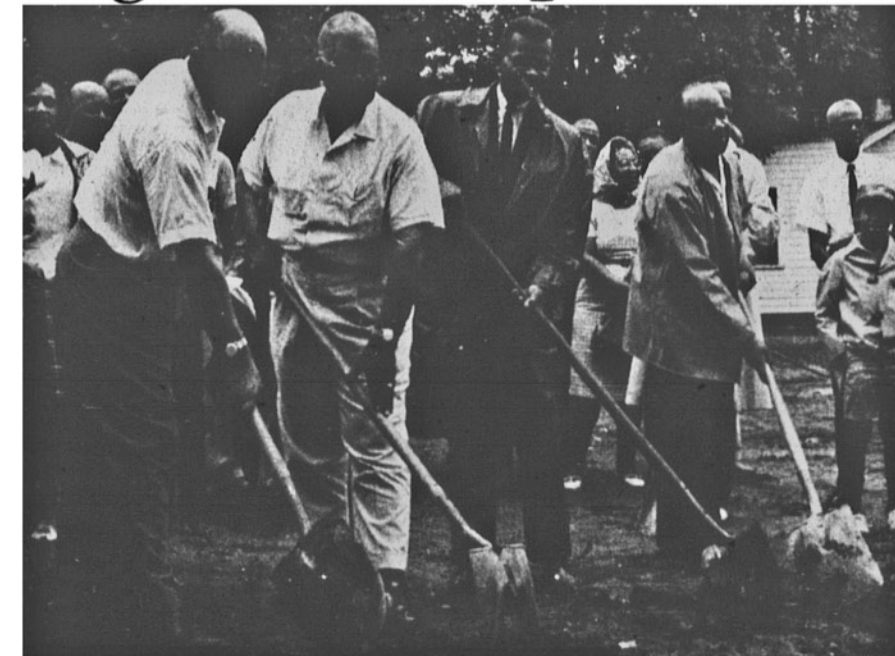
B&P LEAGUE MEMBERS BREAK GROUND FOR NEW SUPERMARKET