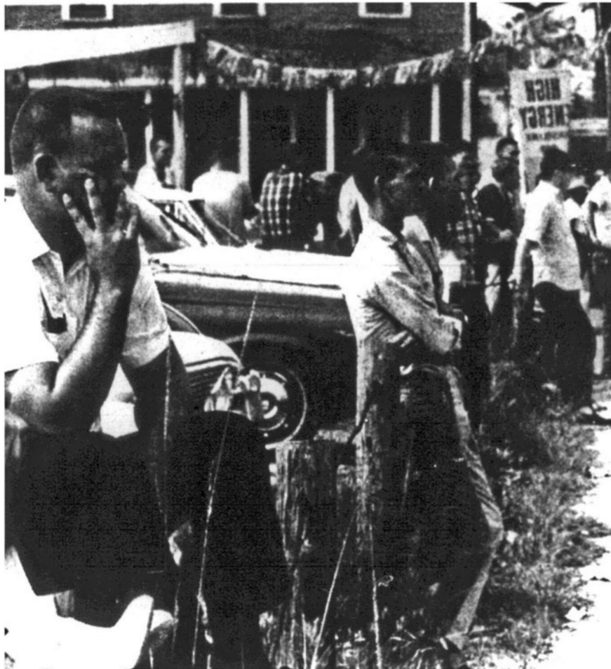
WHITE ONLOOKERS WATCH NEGRO MARCHERS

The Klan responded by burning crosses at the church where the meeting was to be