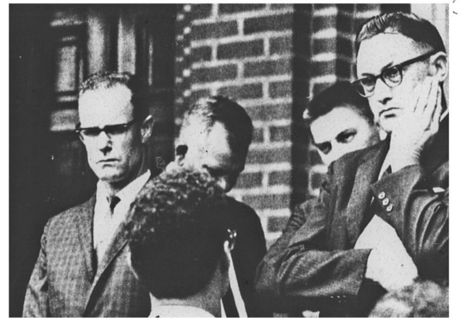
BAFFLED WHITES CONTEMPLATE DEMONSTRATORS