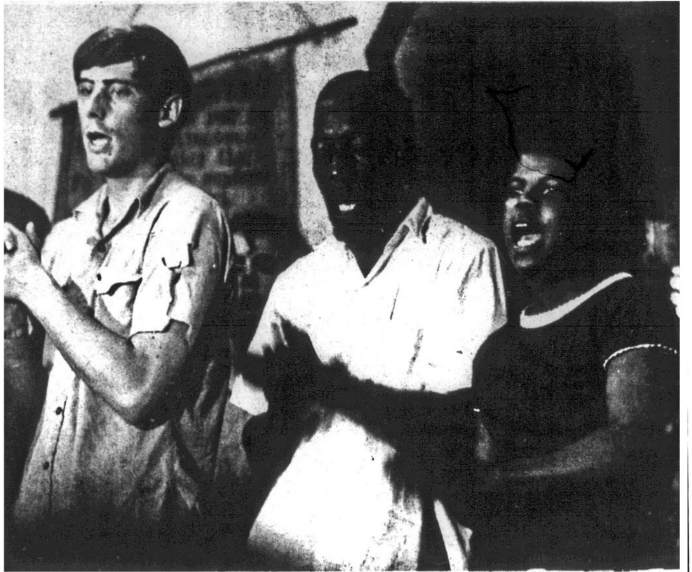
FREEDOM SONGS AT EBENEZER BAPTIST CHURCH IN BOGALUSA