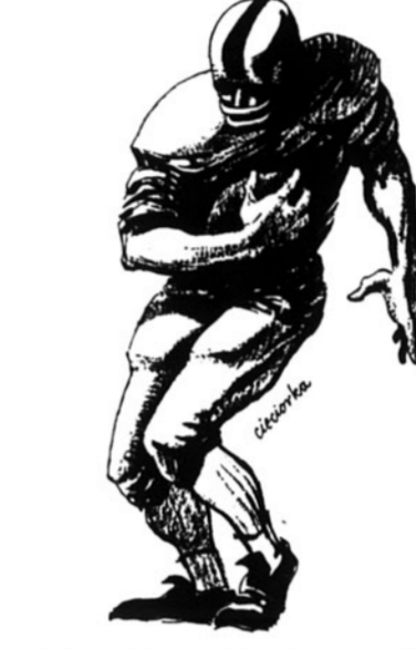
The sixth official will be responsible for keeping time and checking the passer on forward or lateral passes. That sixth man may have one heck of a view this fall. It figures to be a year of the open offenses in the NFL. Ask any self-appointed pro football expert, and he'll probably tell you the St. Louis and Cleveland offenses will battle for the Eastern Conference title, and the Green Bay Packers will lead the West.

20 miles out of her way. She heard she couldn't come through the streets of Newton. "It's given the county a bad name--'Bad Baker.' But I love this county. I went overseas in World War II and fought for it." "I fought for white and colored. You couldn't fight for just one..." "We don't have bad people down here. They're just as good as in any county--a lot of preachers, a lot of religious people, a lot just like me, who don't go to church as much as they should." "We all should go to church."