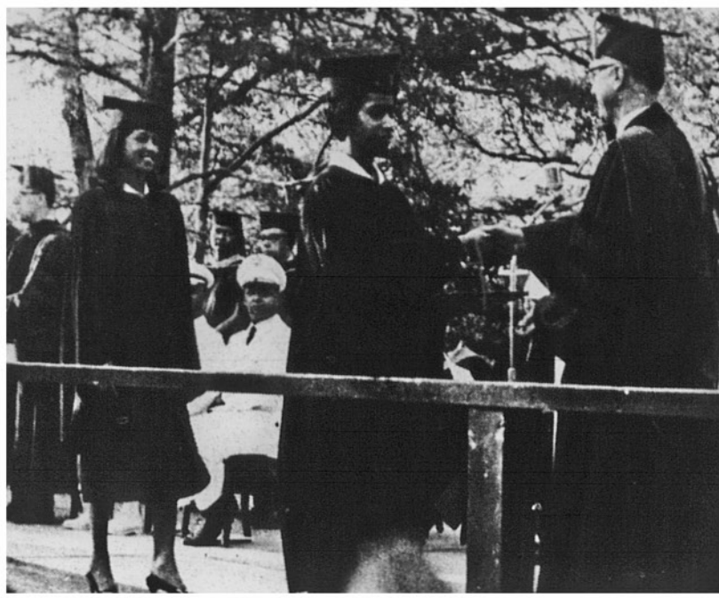
COMMENCEMENT AT TUSKEGEE INSTITUTE MONDAY