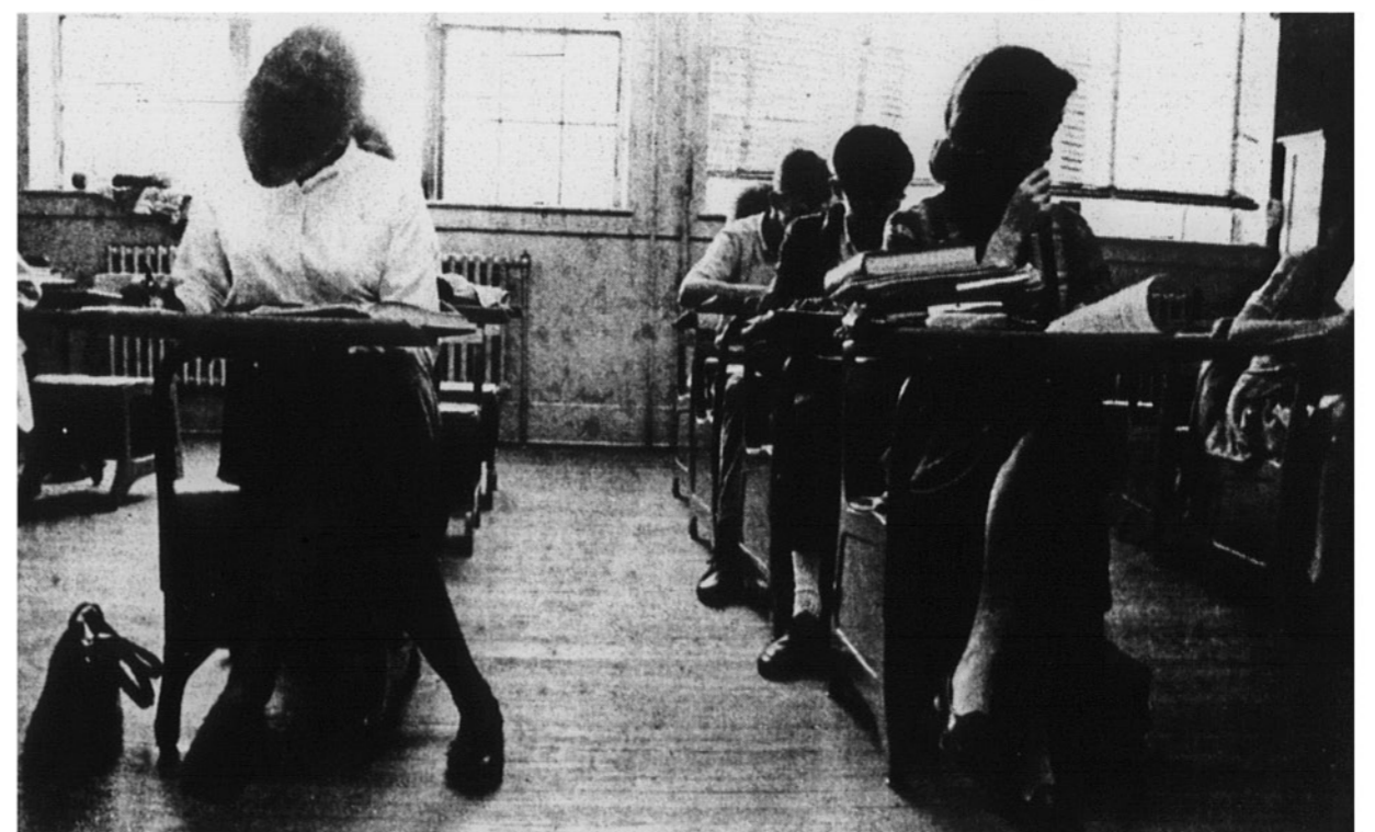
SEGREGATION DIES HARD: IN THIS CLASS NEGROES SIT ON THE LEFT, WHITES ON THE RIGHT