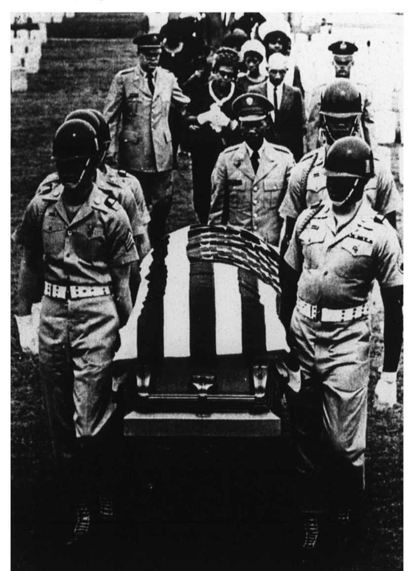
THE BODY OF PFC WILLIAMS IS CARRIED TO GRAVE IN NATIONAL CEMETERY AS THE SOLDIER'S PARENTS

was laid to rest, the fight over where he would be buried stirred the Justice Department, the national press, the Pentagon, and the Negro communities of central Alabama.