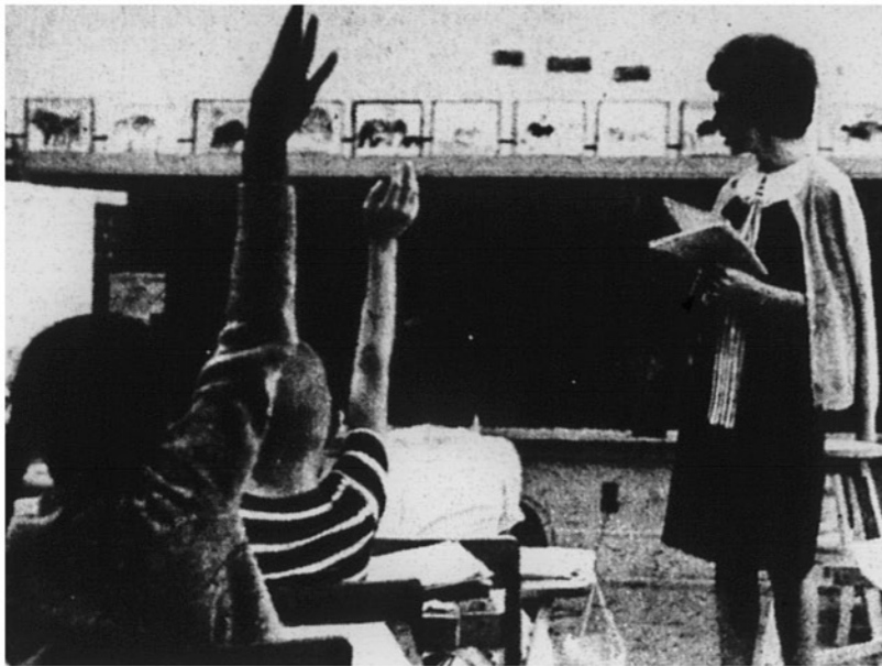
TUSKEGEE HIGH IS RED BRICK OUTSIDE, DESEGREGATED INSIDE

The quiet battle of South Main Street is really only beginning.