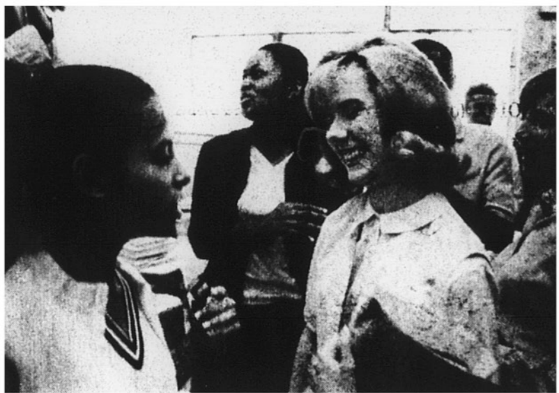
"SOME PEOPLE YOU DON'T LIKE, SOME YOU DO"