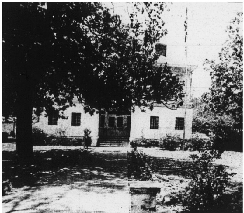
MACON ACADEMY IS ALL WHITE, INSIDE AND OUT